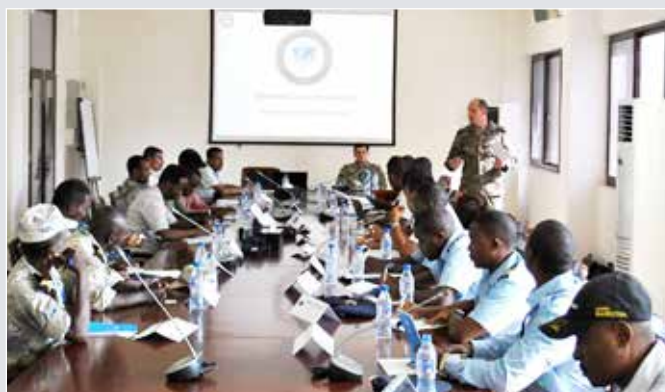
Participants follow keenly through a presentation during the Vessel Protection Detachment (VPD) training held in Djibouti from 7-12 December 2014.

MARSEC COE conducted a pilot course on Vessel Protection Detachment (VPD) in Djibouti from 7-12 December 2014 under the auspices of the DRTC, providing high quality training to maritime team leaders and operations planners from DCoC signatory states. The outcome of the course was of high standards, measuring up to the training needs in the region.