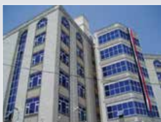
Regional Maritime Information Sharing Centre – ReMISC Sana'a