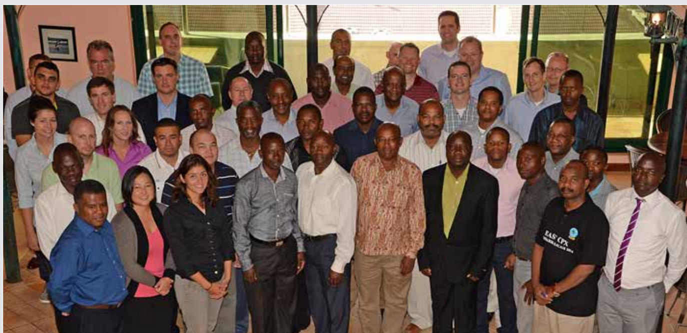
Planners at CUTLASS EXPRESS 2016 Main Planning Event held in Dar es Salaam, United Republic of Tanzania from 4-7 August 2015. The annual exercise is sponsored by U.S. Africa Command (AFRICOM), with support from IMO and the East African Standby Force and focuses on addressing piracy through information sharing and coordinated operations. The exercise has been a regular feature of the DCoC training programme since 2013. The next exercise will take place from 30 January to 6 February 2016.

(LRIT), coastal radar and other sensors and systems have been undertaken and will continue. This is aimed at providing States with a 'picture' of maritime activity throughout the region, thus contributing to enhanced maritime safety and security.