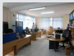
Mombasa Information Sharing Centre