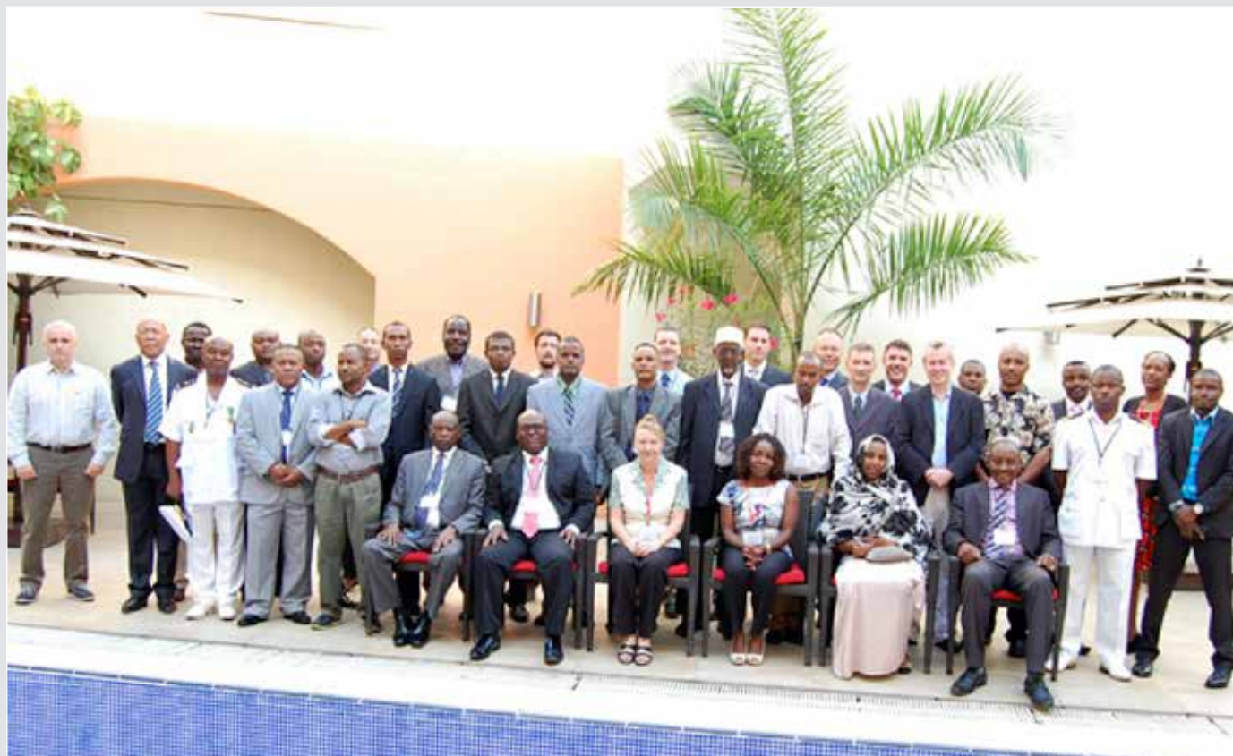
Maritime officials from DCoC countries during a regional workshop held in Dar es Salaam on promotion of Maritime Domain Awareness (MDA) in the West Indian Ocean from 18-20 May 2015.

The event was followed by a two-day MDA tools training on SeaVision and Mercury systems, for MOC and ISC operators from Djibouti, Kenya and United Republic of Tanzania, facilitated by NAVAF and EUNAVFOR.