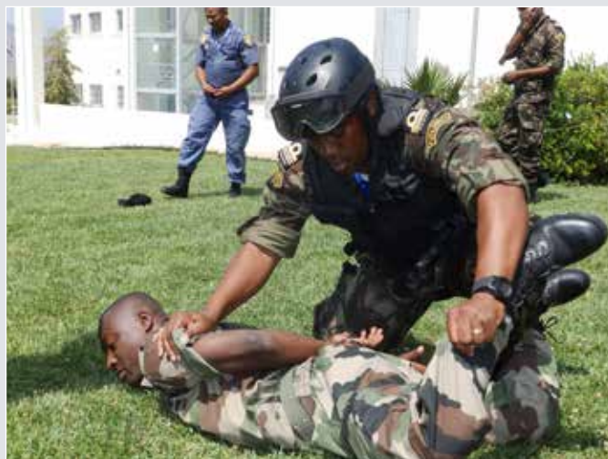
Practical training at NMIOTC