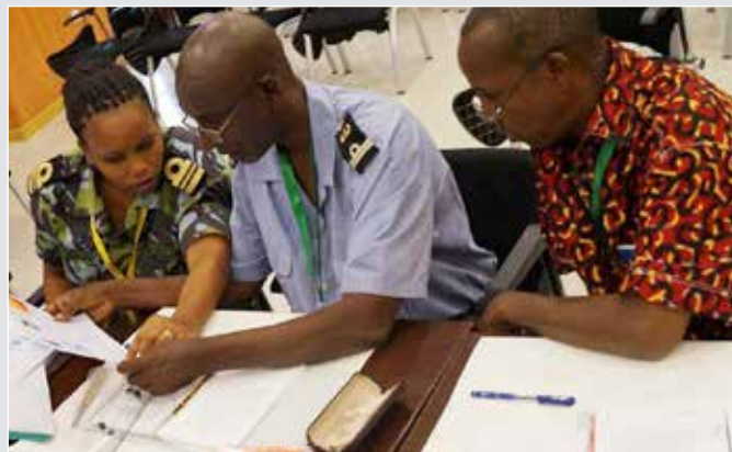
Participants take part in an exercise during the SAR On-Scene Coordination Training held in Khartoum Sudan.

and Sudan also assisted the international facilitators in delivering the course, thereby enhancing their delivery skills and boosting regional skills transfer.