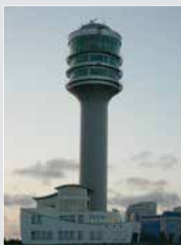
Dar es Salaam Information Sharing Centre