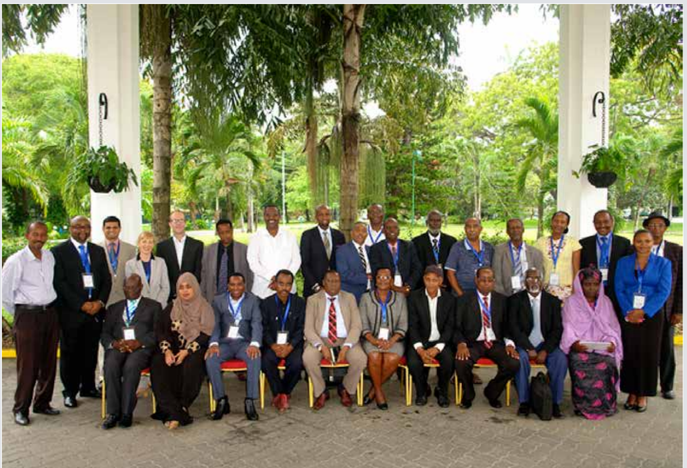
Participants during a three-day Stakeholders Workshop to review draft guidelines for the establishment of a Somalia Maritime legislation, held in Mombasa, Kenya from 27-29 April 2015.