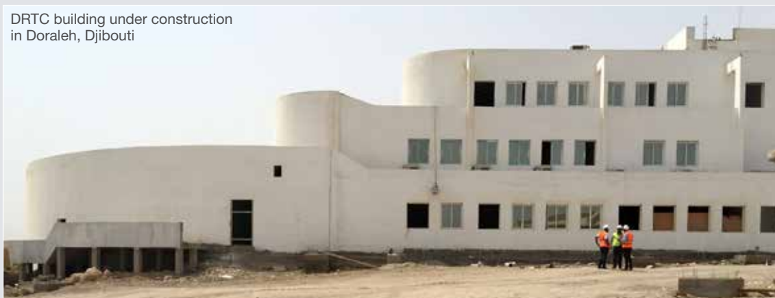
DRTC building under construction in Doraleh, Djibouti