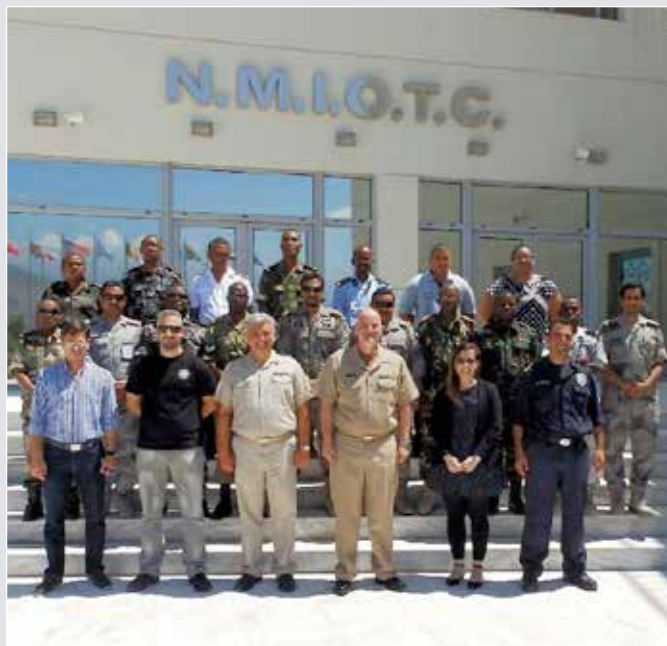
Participants of the 'Advanced Maritime Law Enforcement Train the Trainers Course' held at NMIOTC from 29 June to 10 July 2015 pose for a group photo.

The course was designed for officers from training institutions of marine police/ coast guard/ naval forces and prosecution services, employed as trainers in Maritime law enforcement or those earmarked to become trainers. It was attended by 18 participants from Comoros, Djibouti, Kenya, Seychelles, Madagascar, Mozambique, Saudi Arabia, United Republic of Tanzania and Somalia.